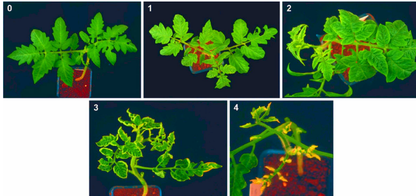
Plate 1. Tomato leaves showing varying degrees of symptom severity from TYLCV infection. Symptom scoring scale: 0-4 according to Friedmann et al. (1998)

Severity of the symptoms was estimated using the formula advanced by Njock and Ndip (2007).