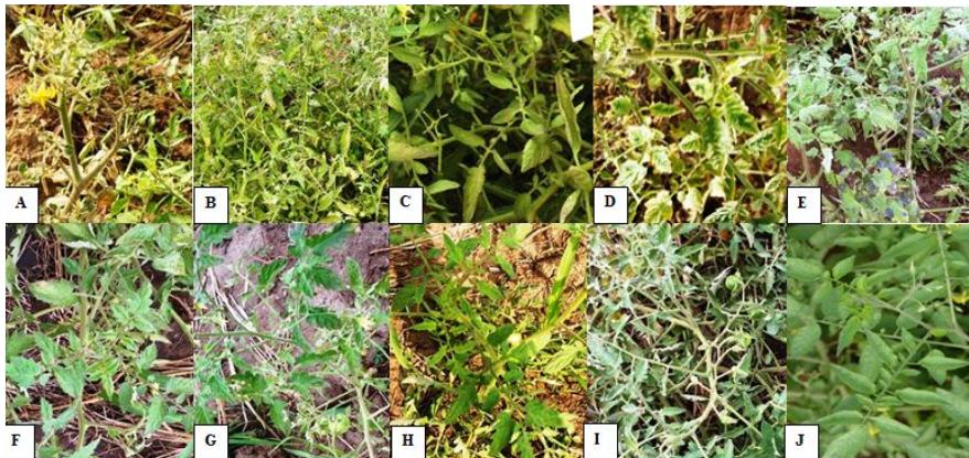
Plate 2. Variation in Leaf Symptoms of TYLCD among Ten Tomato Varieties/Breeding Lines in the Field. (A) Roma, (B) Roma x Wild, (C) Roma x Rw, (D) Wosowoso, (E) Woso x Wild, (F) Woso x Ww, (G) Cherry red, (H) Cherry Red x Wild, (I) Cherry Red x CRW, (J) Wild tomato